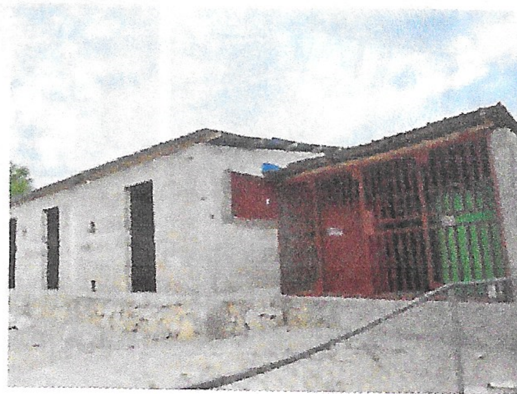
FoH Purifier System Adjacent to New School Addition in Haiti

With the help of several kind donors, FoH is half way through building a 60' x 30' addition to the existing school adding 5 additional rooms. The school walls and roof have already been built. During the next phase FoH will fund concrete flooring, doors, windows, and build tables with benches. This school is needing $5,300 to complete this last phase. Would you please consider helping to fund a part of this project?