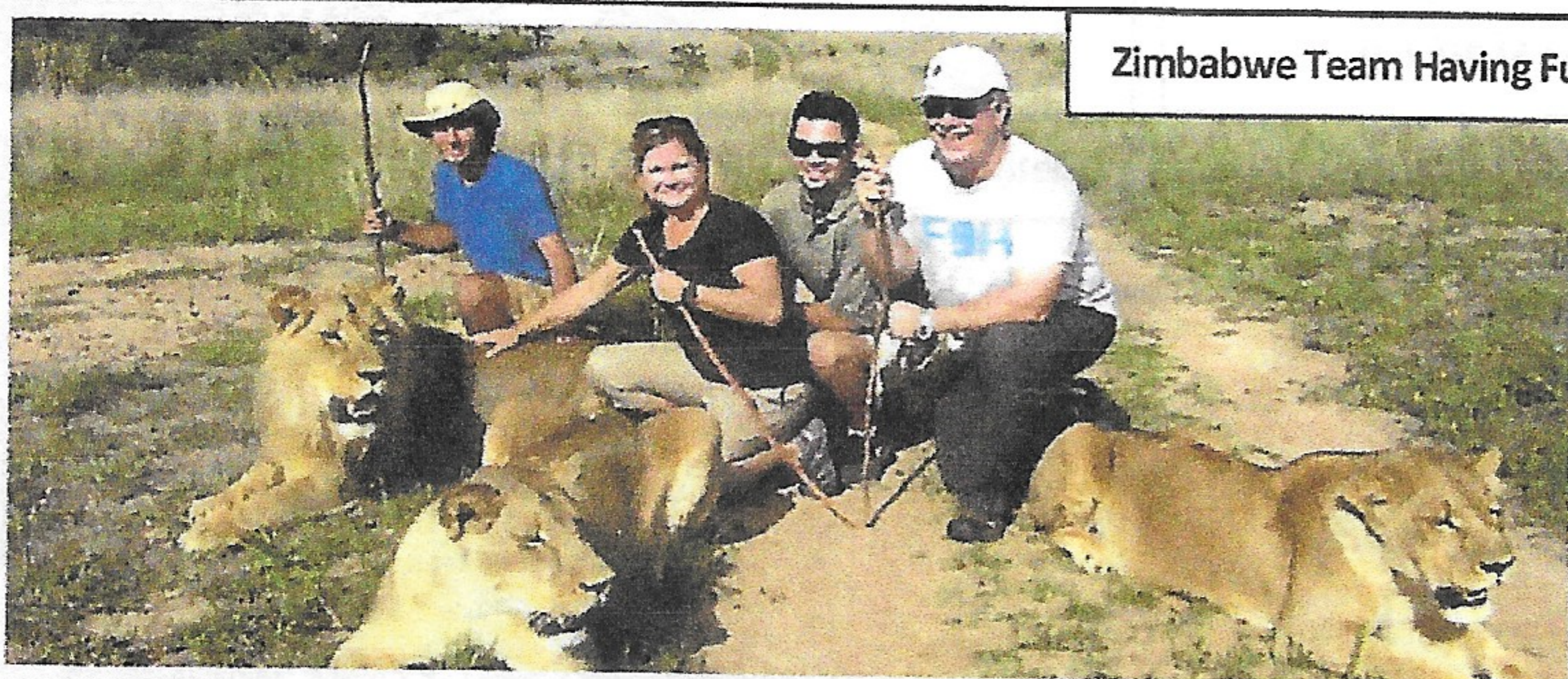
Zimbabwe Team Having Fun!

Become a "Water Is Life" monthly donor at www.FountainsOfHope.org/donate