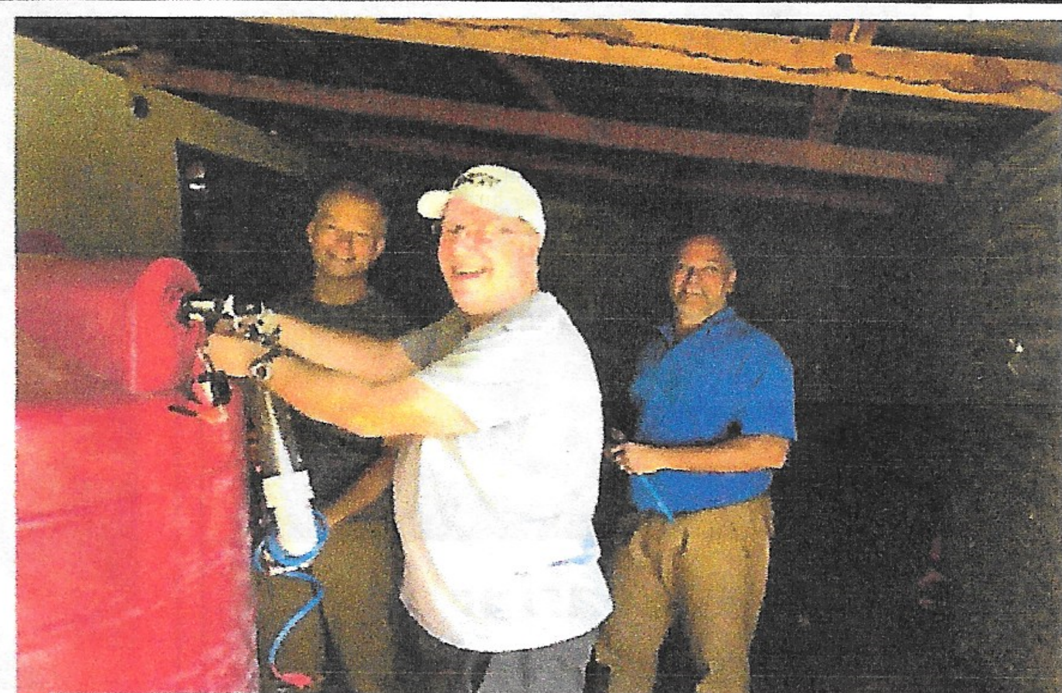
Team in Le Digue Mathiou, Haiti (above) Cistern and 2-tank system at Gros Morne, Haiti (below)

Become a "Water is Life" monthly donor, and make a commitment to help these communities and others like them obtain safe drinking water! Visit fountainsofhope.org/donate to sign-up.